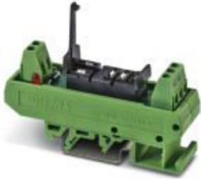
VARIOFACE base module for G2R relay, 1PDT

Please be informed that the data shown in this PDF Document is generated from our Online Catalog. Please find the complete data in the user's documentation. Our General Terms of Use for Downloads are valid ( http://phoenixcontact.com/download )