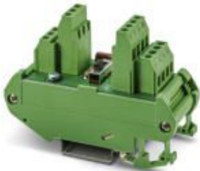
VARIOFACE module for Modbus

Please be informed that the data shown in this PDF Document is generated from our Online Catalog. Please find the complete data in the user's documentation. Our General Terms of Use for Downloads are valid ( http://phoenixcontact.com/download )