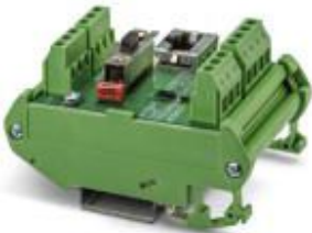
VARIOFACE program module for Modbus Plus

Please be informed that the data shown in this PDF Document is generated from our Online Catalog. Please find the complete data in the user's documentation. Our General Terms of Use for Downloads are valid ( http://phoenixcontact.com/download )