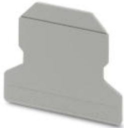
Partition plate, Length: 56 mm, Width: 1.5 mm, Height: 45.7 mm, Color: gray

Please be informed that the data shown in this PDF Document is generated from our Online Catalog. Please find the complete data in the user's documentation. Our General Terms of Use for Downloads are valid ( http://phoenixcontact.com/download )