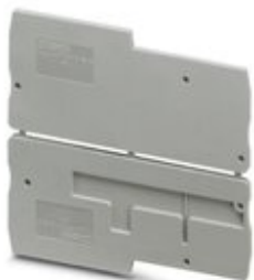
End cover, length: 74.4 mm, width: 2.2 mm, height: 33.8 mm, color: gray

Please be informed that the data shown in this PDF Document is generated from our Online Catalog. Please find the complete data in the user's documentation. Our General Terms of Use for Downloads are valid ( http://phoenixcontact.com/download )