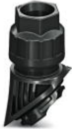
EVO plastic cable gland with bayonet locking, for housing series B, size M25, cable diameter: 9 ... 17 mm

Please be informed that the data shown in this PDF Document is generated from our Online Catalog. Please find the complete data in the user's documentation. Our General Terms of Use for Downloads are valid ( http://phoenixcontact.com/download )