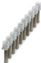
Jumper, pitch: 8 mm, number of positions: 10, color: silver

Please be informed that the data shown in this PDF Document is generated from our Online Catalog. Please find the complete data in the user's documentation. Our General Terms of Use for Downloads are valid ( http://phoenixcontact.com/download )