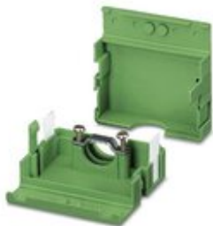
Cable housing, pitch: 0 mm, number of positions: 4, color: green

Please be informed that the data shown in this PDF Document is generated from our Online Catalog. Please find the complete data in the user's documentation. Our General Terms of Use for Downloads are valid ( http://phoenixcontact.com/download )