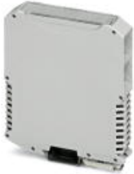
DIN rail housing, Complete housing with metal foot catch, tall design, with vents, width: 22.5 mm, color: light gray (7035)

Please be informed that the data shown in this PDF Document is generated from our Online Catalog. Please find the complete data in the user's documentation. Our General Terms of Use for Downloads are valid ( http://phoenixcontact.com/download )