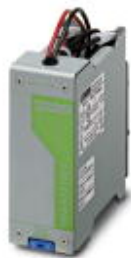
Energy storage device, lead AGM, VRLA technology, 24 V DC, 1.3 Ah.

Please be informed that the data shown in this PDF Document is generated from our Online Catalog. Please find the complete data in the user's documentation. Our General Terms of Use for Downloads are valid ( http://phoenixcontact.com/download )