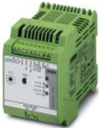
Uninterruptible power supply with integrated power supply unit, 2 A, in combination with MINI-BAT/24/DC 0.8 AH or 1.3 AH

Please be informed that the data shown in this PDF Document is generated from our Online Catalog. Please find the complete data in the user's documentation. Our General Terms of Use for Downloads are valid ( http://phoenixcontact.com/download )