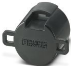
Protective cap for 3 and 5-pos. PRC device plugs

Please be informed that the data shown in this PDF Document is generated from our Online Catalog. Please find the complete data in the user's documentation. Our General Terms of Use for Downloads are valid ( http://phoenixcontact.com/download )