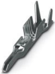
Crimp contact, type of contact: Male connector, connection method: Crimp connection, contact surface: Tin

Please be informed that the data shown in this PDF Document is generated from our Online Catalog. Please find the complete data in the user's documentation. Our General Terms of Use for Downloads are valid ( http://phoenixcontact.com/download )