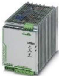
Primary-switched QUINT POWER power supply for DIN rail mounting with SFB (Selective Fuse Breaking) Technology, input: 3-phase, output: 48 V DC/20 A

Please be informed that the data shown in this PDF Document is generated from our Online Catalog. Please find the complete data in the user's documentation. Our General Terms of Use for Downloads are valid ( http://phoenixcontact.com/download )