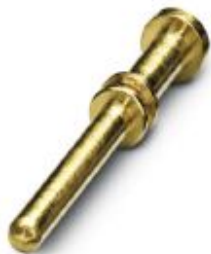
Crimp contact, turned, contact diameter: 2 mm, crimp range: 0.75 mm 2 ... 1.5 mm 2

Please be informed that the data shown in this PDF Document is generated from our Online Catalog. Please find the complete data in the user's documentation. Our General Terms of Use for Downloads are valid ( http://phoenixcontact.com/download )