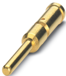
Crimp contact, turned, contact diameter: 2 mm, crimp range: 2.5 mm 2 ... 4 mm 2

Please be informed that the data shown in this PDF Document is generated from our Online Catalog. Please find the complete data in the user's documentation. Our General Terms of Use for Downloads are valid ( http://phoenixcontact.com/download )