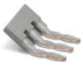
Insertion bridge, Number of positions: 3, Color: gray