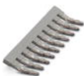
Insertion bridge, Number of positions: 10, Color: gray