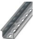
DIN rail, material: Galvanized, perforated, height 15 mm, width 35 mm, length: 2 m

DIN rail perforated - NS 35/15 ZN PERF 2000MM - 1206599