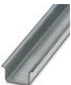
DIN rail, material: Galvanized, unperforated, height 15 mm, width 35 mm, length: 2 m

DIN rail, unperforated - NS 35/15 ZN UNPERF 2000MM - 1206586