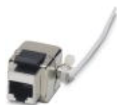
RJ45 socket insert, modular (Keystone), CAT5e, 8-pos., shielded, with cable connection (LSA), for solid wires AWG 26 ... 22

RJ45 socket insert - VS-08-BU-RJ45/KA/LSA - 1689459