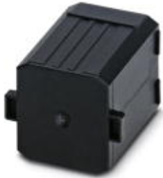
Protective cover, IP65, with push-pull locking for covering the contact insert in the push-pull connector for RJ45 and SC-RJ, plastic

Please be informed that the data shown in this PDF Document is generated from our Online Catalog. Please find the complete data in the user's documentation. Our General Terms of Use for Downloads are valid ( http://phoenixcontact.com/download )