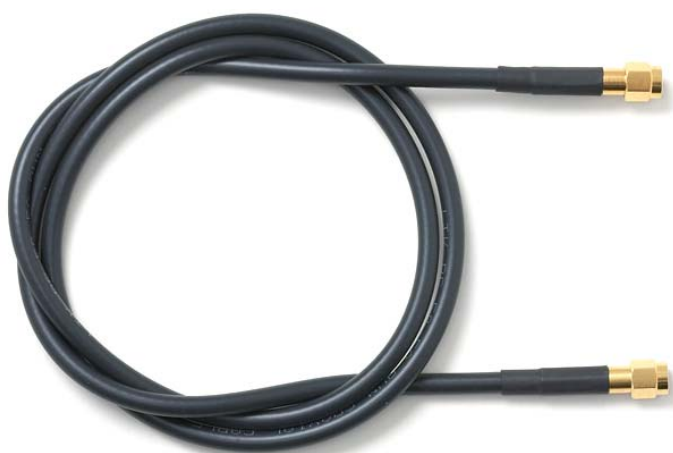
Model 4846-C SMA Plug to SMA Plug, RG58C/U

Small size, and durability for confident connections