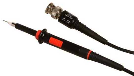
Model 6491 Modular Passive Oscilloscope Probe