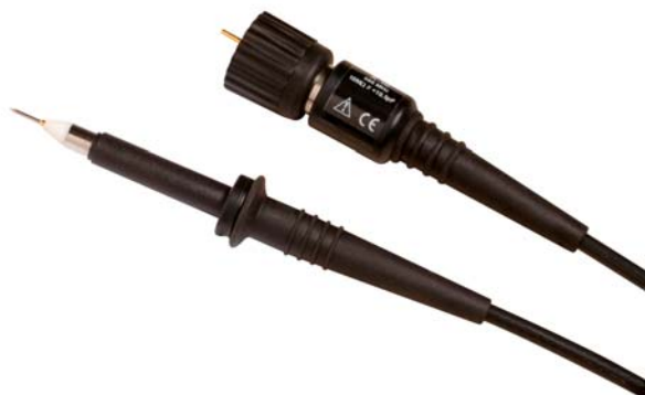
Model 6554 Microline Passive Oscilloscope Probe