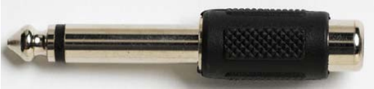
Model 6878 1/4" Plug (mono) / RCA Jack Adapter