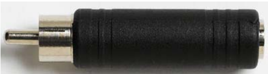
Model 6879 1/4" Jack (mono) / RCA Plug Adapter