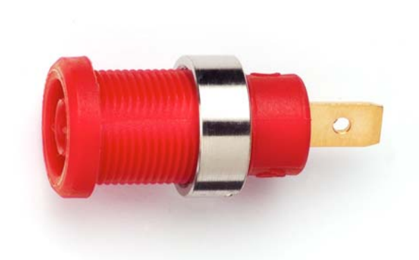
Model 72913 Panel Mount IEC61010 4mm (0.16in) Jack for Sheathed Banana Plugs

Panel Mt IEC61010 4mm (0.16in) Jack for Sheathed Banana Plugs