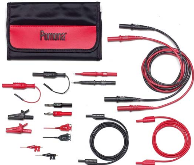
Model 72928 SMD Multi-Use Test Kit

Everything you need for SMD Test with your DMM in one kit