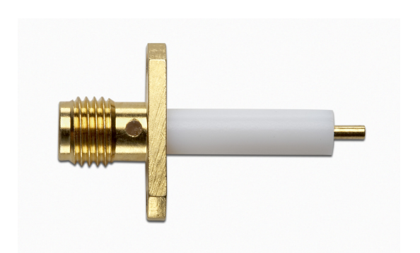
Model 72961 SMA JACK PANEL RECEPTACLE (2 HOLE)