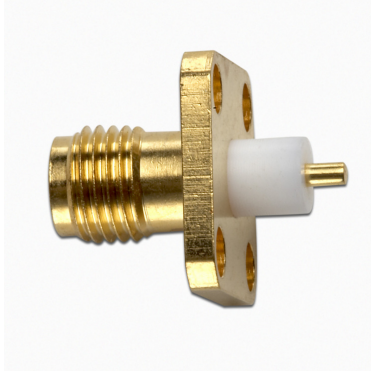
Model 72962 SMA JACK PANEL RECEPTACLE (4 HOLE)

High bandwidth, small size, and durability for confident connections