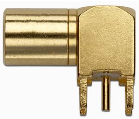
Model 72997 SMB PLUG R/A PCB RECEPTACLE