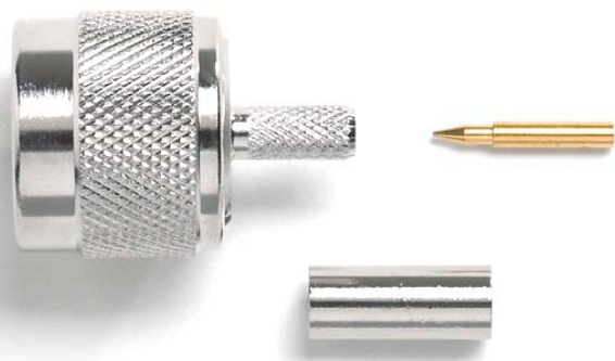
Model 73050 N Type Plug, 50 Ohm, Crimp Type, RG58, 141