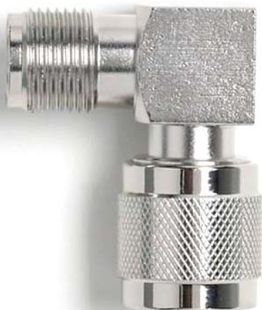
Model 73053 TNC Right-Angle Jack to Plug Adapter