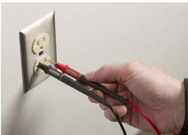
Increased tip exposure for CAT II probing