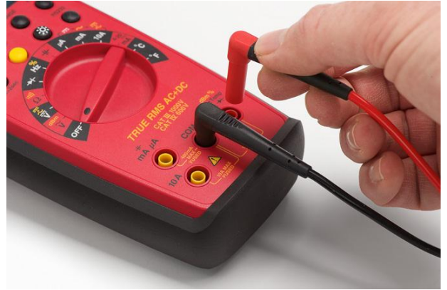
Universal plugs compatible with all 4mm shrouded inputs