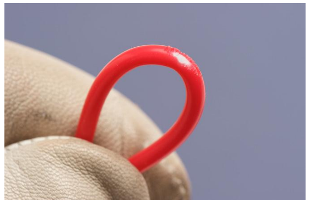
WearGuard™ indicator shows insulation damage

USA: Sales: 800-490-2361 Technical Support: technicalsupport@pomonatest.com Fax: 425-446-5844 Europe: 31-(0) 40 2675 150 International: 425-446-5500 Where to Buy: www.pomonaelectronics.com