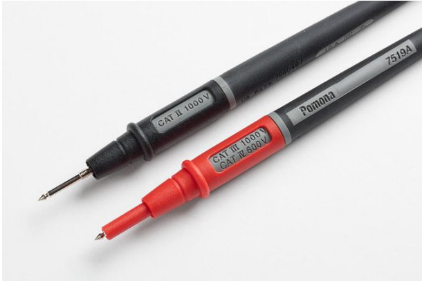
Probes always show the correct category rating for the tip exposure being used