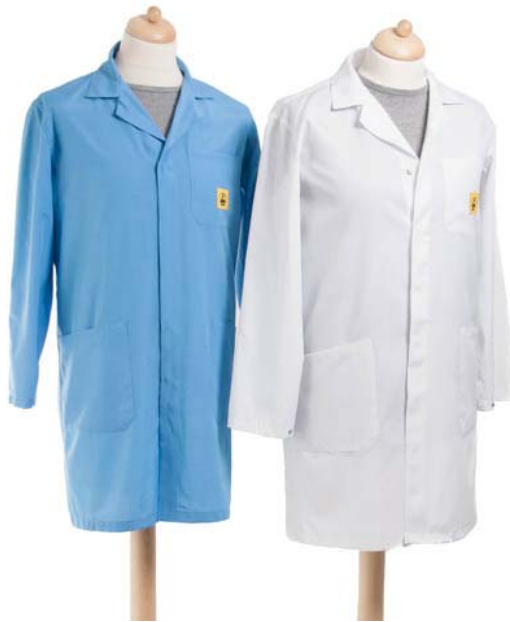
STC120x in blue