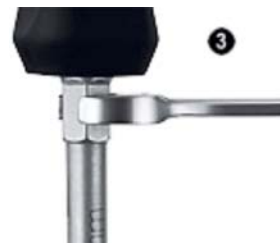
With hexagon flat for using an openend spanner as lever (for sizes 8 and 10 on slotted and PH3 and PZ3 version).