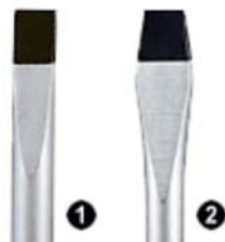
Matt-chrome plated blades of chrome vanadium special steel with precision black tip.