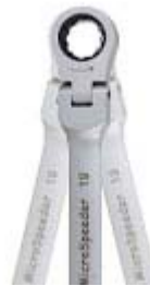
Where old generation spanners cannot be repositioned the Speeder's ratchet function takes over.