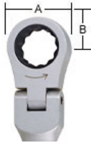
Compact design allows for minimal outer dimensions (A+B).