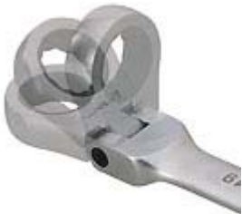
Inversible joint: Unbeatable in tight places!