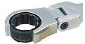
A very slim head provides shelter to the fully encapsulated drive.