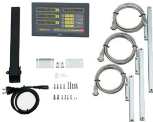
Digital position indicator DA 3.1 Mounting kit