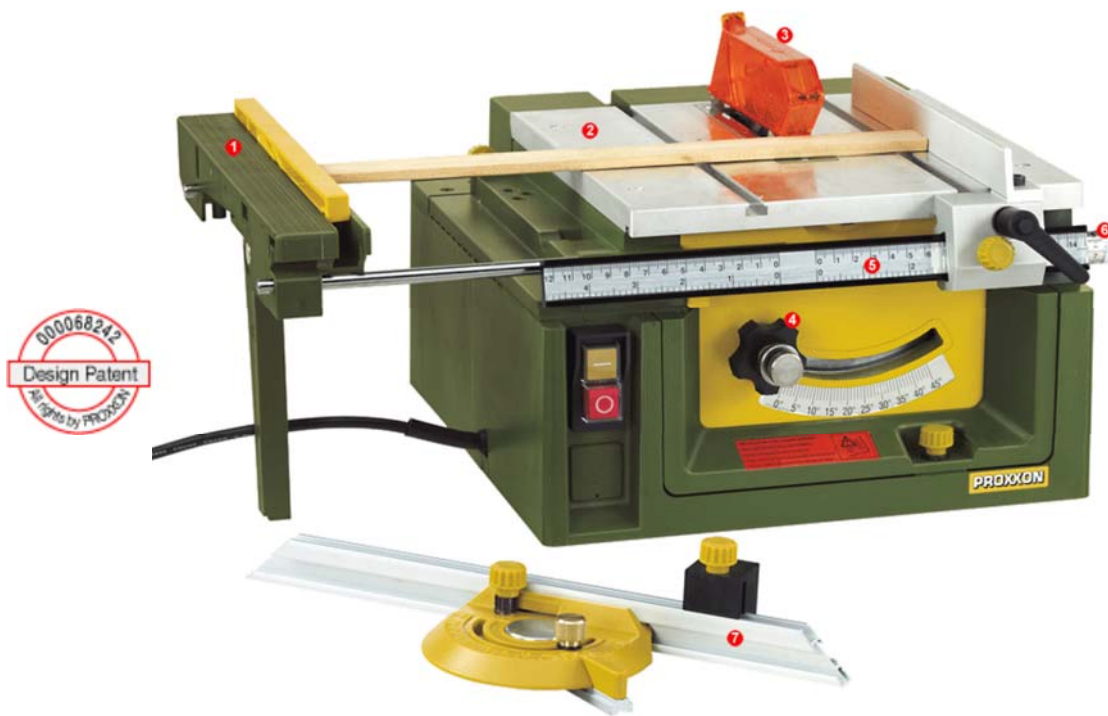
Table saw FET

For precise, straight cuts without refinishing! With micro-adjustable longitudinal stop.