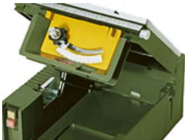
Table and drive can be lifted up and supported like an engine bonnet. For cleaning the device and easy saw blade replacement.

Non-slotted sawing cap cover of ABS for tight tolerances between saw blade and table (is slotted from below by the FET saw blade). For cutting very small parts.