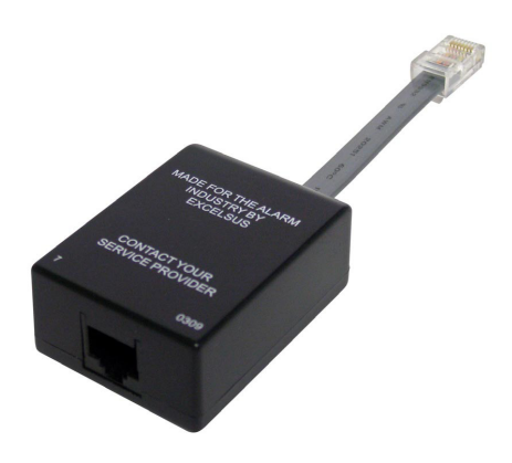
Z-BLOCKER® Z-A431PJ31X-A Alarm Panel DSL Filter