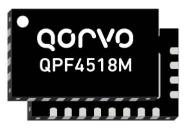
24 Pin 5x3 mm QFN Package