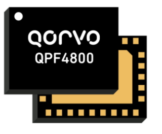
28 Pin 4x3 mm Laminate Package