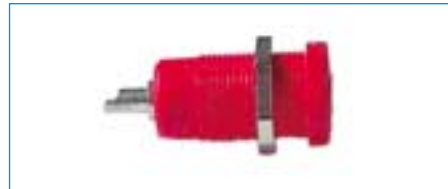
R 941 92* 600