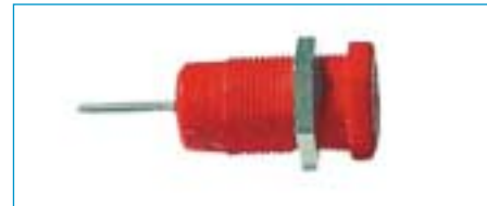
R 941 92* 601