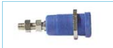
R 941 92* 603