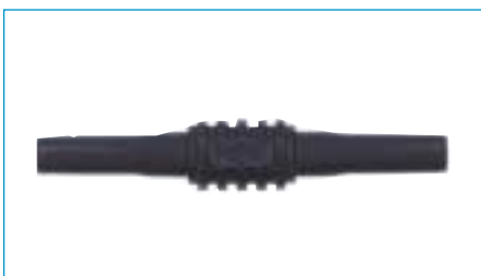
R 941 96* 600