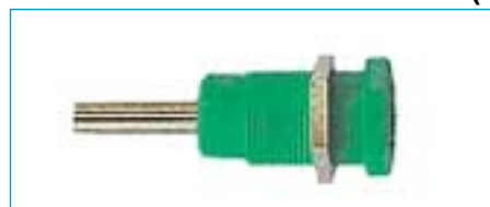
R 941 92* 604