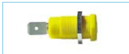
R 941 92* 602