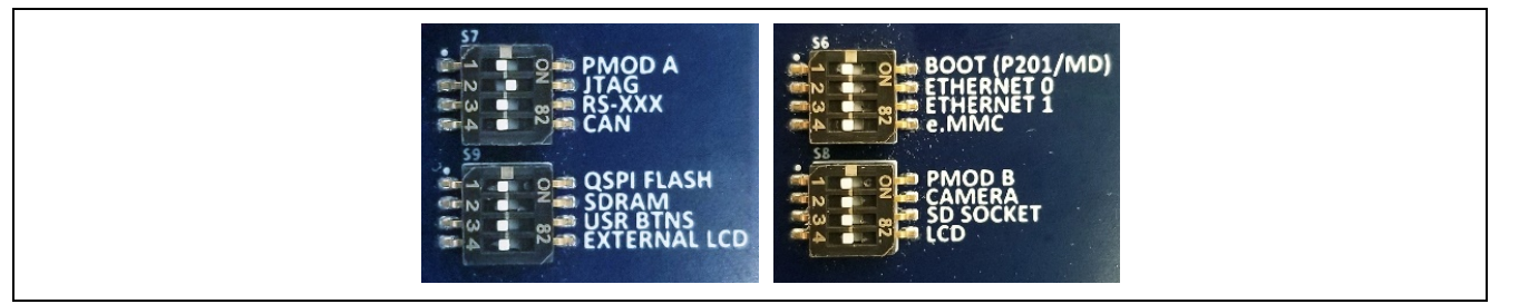
Figure 2 DIP Switch Settings

In DIP switch S7, move switch 2 (JTAG) to ON position. All other switches in this DIP switch should be set to OFF. The OFF position is marked by the white dot. In DIP switches S6, S7, S8 and S9, set all switches to OFF.