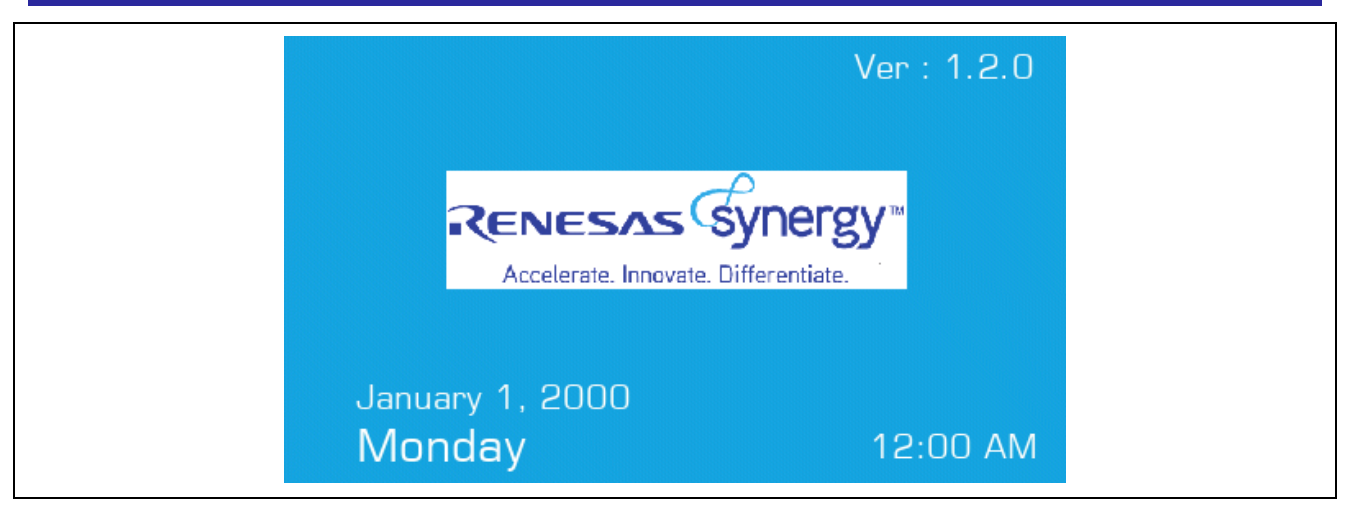
Figure 4 Splash Screen - OOB