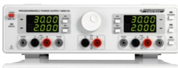
R&S®HM8143 three-channel arbitrary power supply