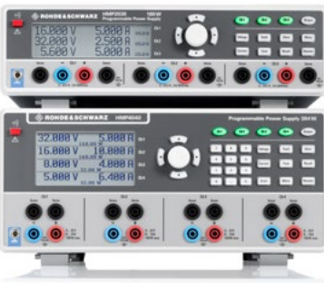
R&S®HMP2030 three-channel and R&S®HMP4040 four-channel power supply