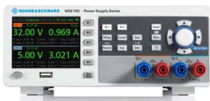
Front view of the R&S®NGE102B