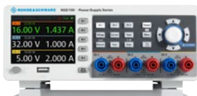
R&S®NGE103B three-channel power supply