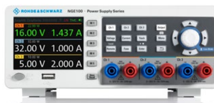
Front view of the R&S®NGE103B