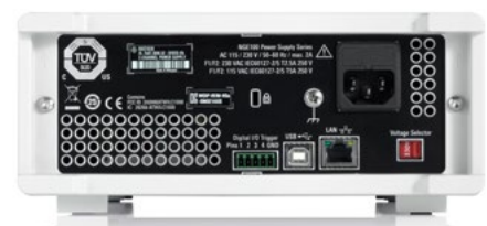
Rear view of the R&S®NGE100B series