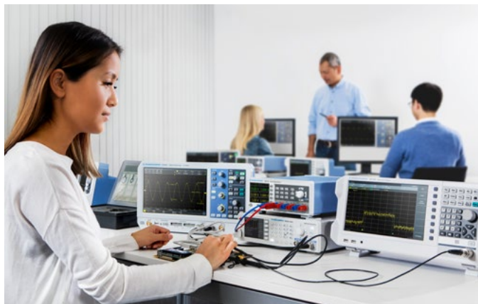
Tailored to be used in education, labs and system racks

Whatever might happen when unskilled students gain their first experience in practical work with electronics, all outputs of the R&S®NGE100B power supply series are short-circuit-proof and will therefore not be damaged.