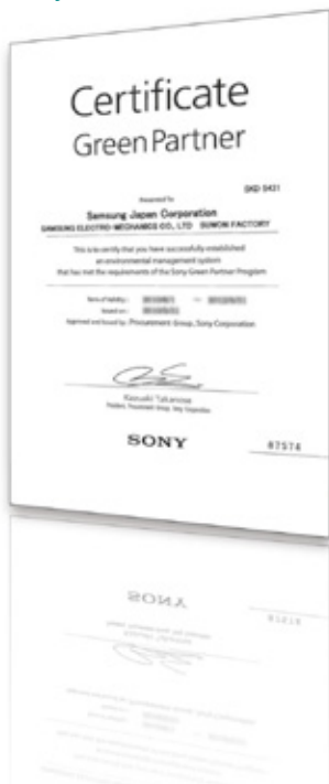
Sony Green Partner