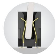
Custom designs allow for misalignment in the X-Y axes (HSEC1)