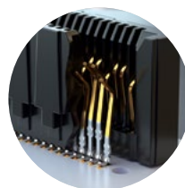
Differential pair for increased speed (HSEC8-DP)