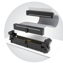
IDC cable assemblies with rugged strain relief (FFSD/FFMD, FFTP/FMTP)