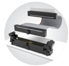
IDC cable assemblies with rugged strain relief (FFSD/FFMD, FFTP/FMTP)