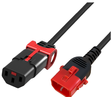
Locking functionality on both ends of the cord