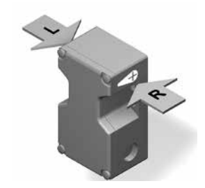
BNS 16-12ZD BNS 16-12ZU BNS 16-12ZV